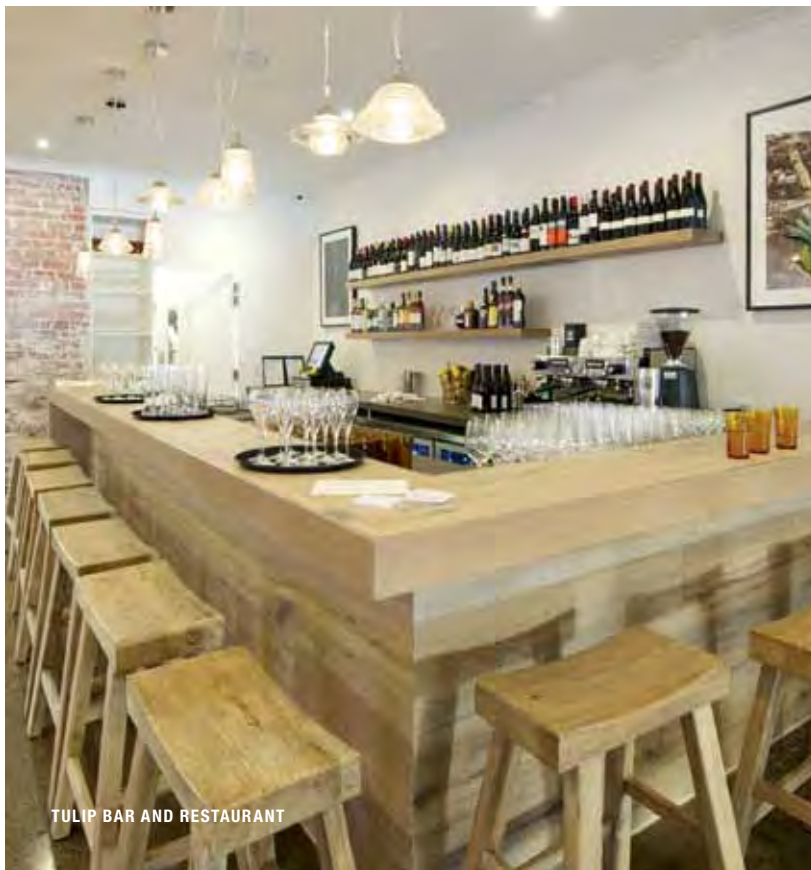
TULIP BAR AND RESTAURANT