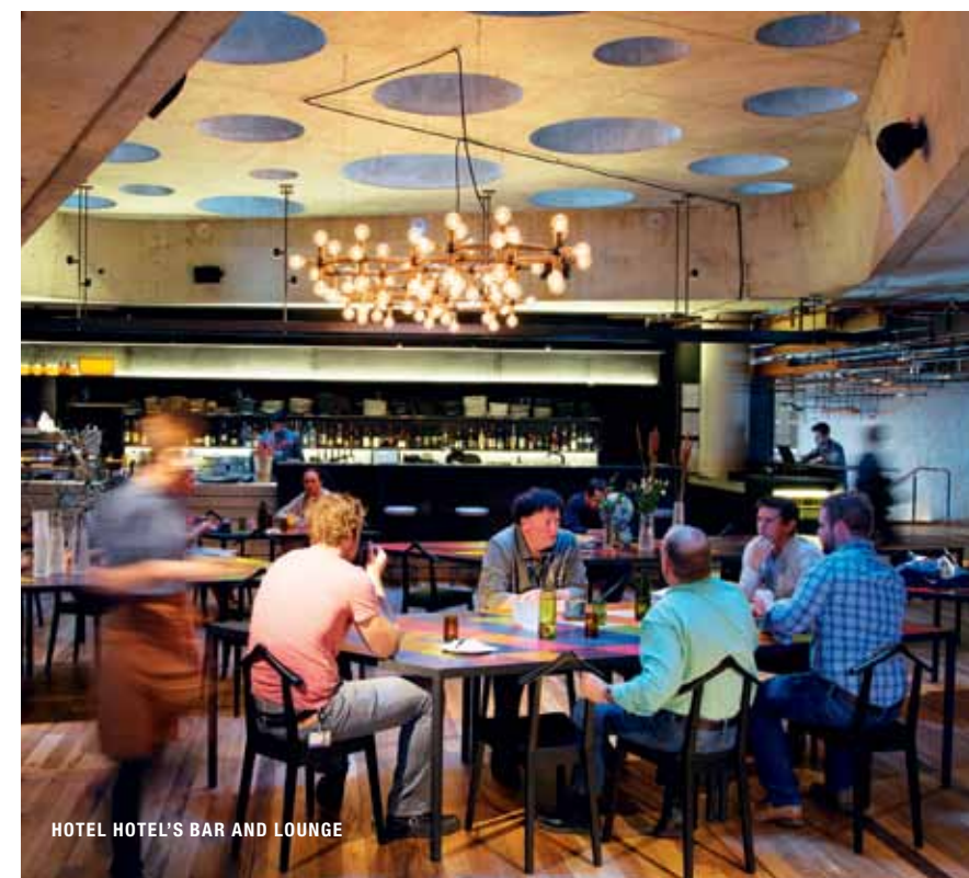
HOTEL HOTEL'S BAR AND LOUNGE