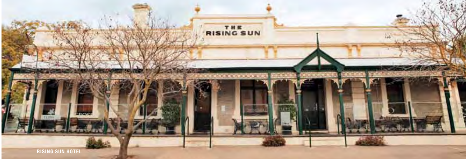
RISING SUN HOTEL

It may only be a tiny speck on the map, but the hamlet of Auburn in Clare Valley punches well above its weight in the gourmet stakes. The new Clare Valley Brewing Co tasting room offers a range of local beers and ciders on tap, as well as wines from Jeanneret and Good Catholic Girl , while the Grosset , Mount Horrocks and Taylor's cellar doors are also worth a visit. At the new Terroir restaurant, chef Dan Moss specialises in local flavours (all ingredients are sourced within 100 miles), while you'll find some of the best pub grub in the state at revamped Rising Sun Hotel next door. Catch some shut-eye in one of the lovely, rustic cottages at Mellers at Auburn (previously Cygnets) before another day's gorging. mellersofauburn.com.au