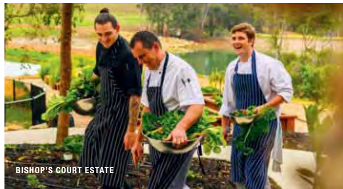
BISHOP'S COURT ESTATE