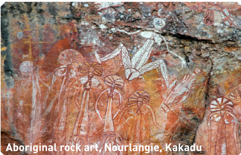
Aboriginal rock art, Nourlangie, Kakadu