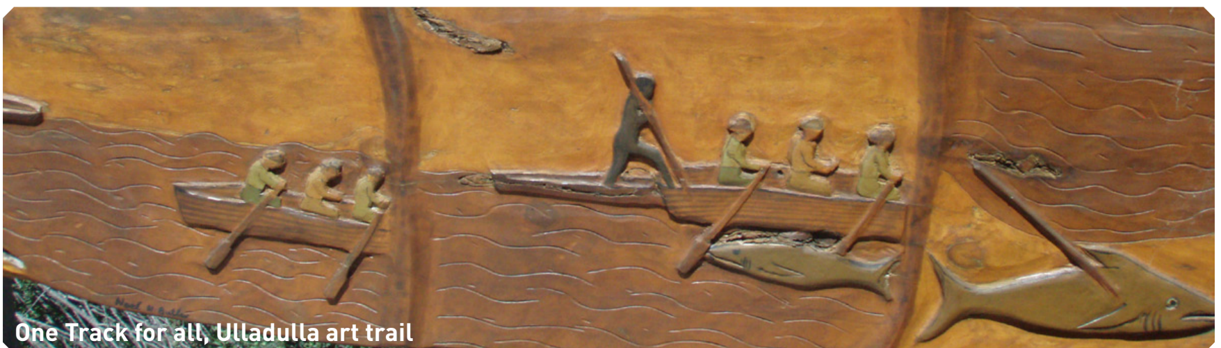
One Track for all, Ulladulla art trail