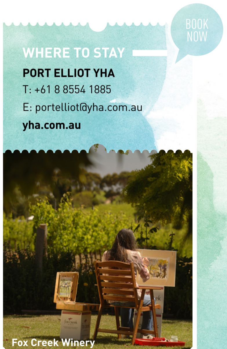
Fox Creek Winery