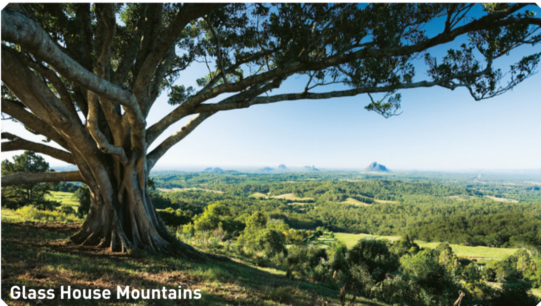
Glass House Mountains