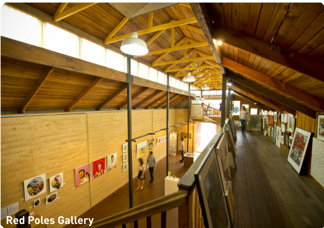
Red Poles Gallery