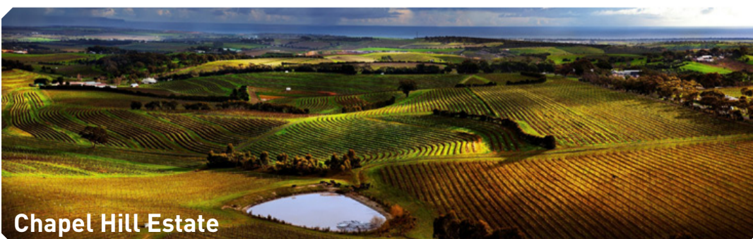
Chapel Hill Estate