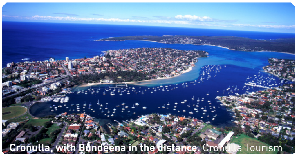
Cronulla, with Bundeena in the distance.